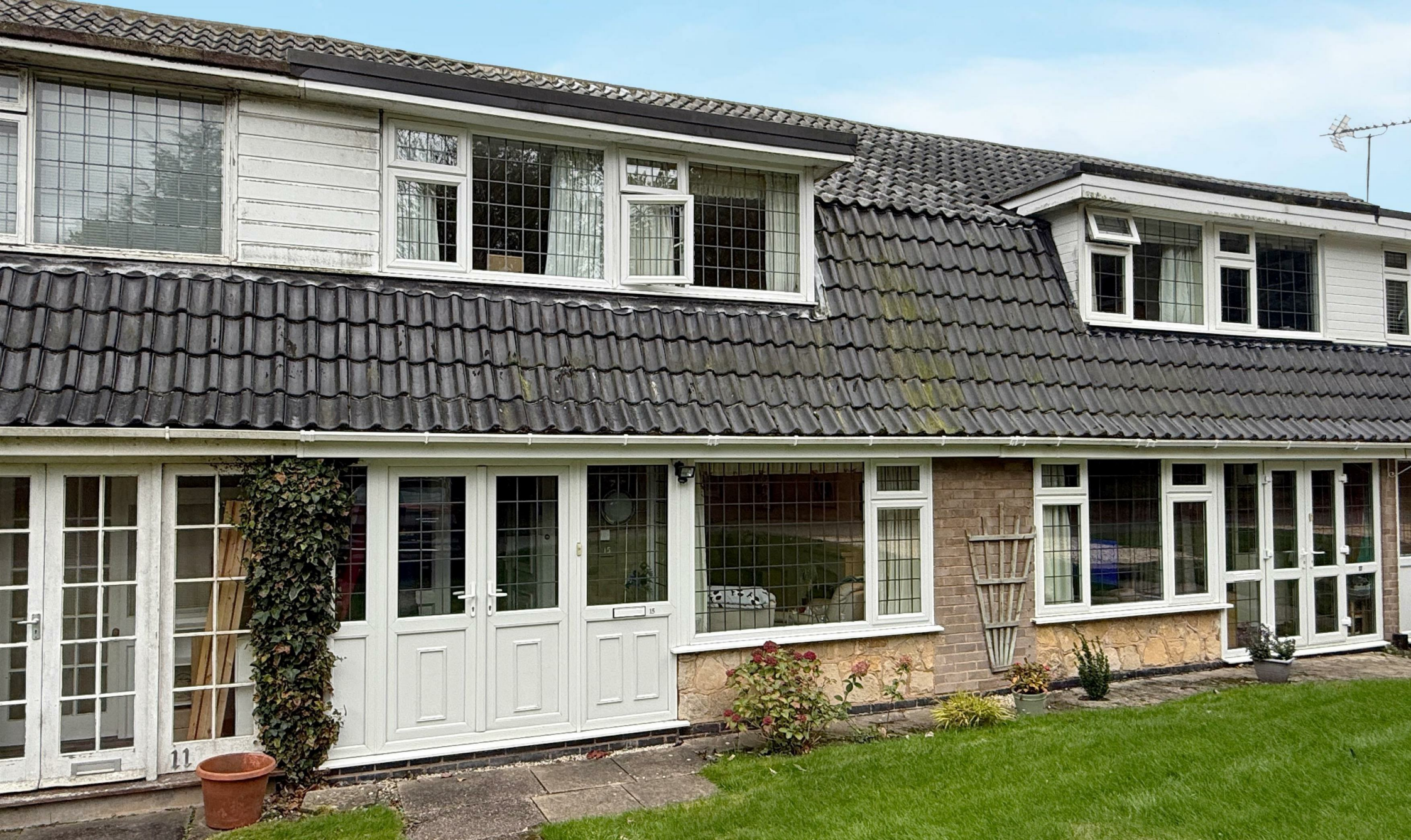
Pound Field , Wootton Wawen Henley-in-Arden, B95 6AQ